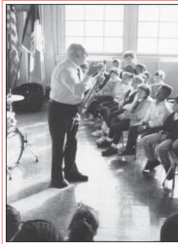
Building on children's strengths and natural abilities

Current research continues to document a positive correlation between children who participate in music experiences, and success in other academic areas. Our Music & Literacy Enrichment Workshops incorporate principles of child development and nurture a range of intelligences in a challenging, and enriched learning environment.