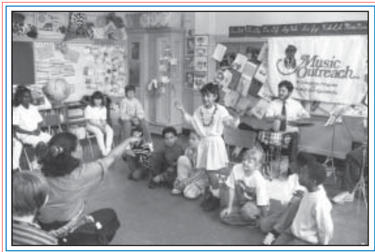
Engaging Learners in Hands-on Workshops

In school classrooms across the city, MUSIC OUTREACH brings a new and exciting dimension to learning. Our Music & Literacy Workshops, Staff Development, and School-Day Orchestral Concerts provide opportunities for young students to participate in creative, and developmentally appropriate educational experiences in the Language Arts, Science, and Music. For children of diverse backgrounds and abilities, our integrated approach enhances motivation and opens up new pathways for learning.