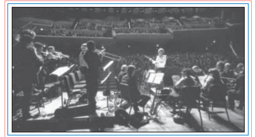
West End Symphony the Resident Orchestra of MUSIC OUTREACH

"Your Program gives our youngsters an opportunity to explore some of the marvelous and motivating experiences the world of music has to offer them." P.S. 104 Queens