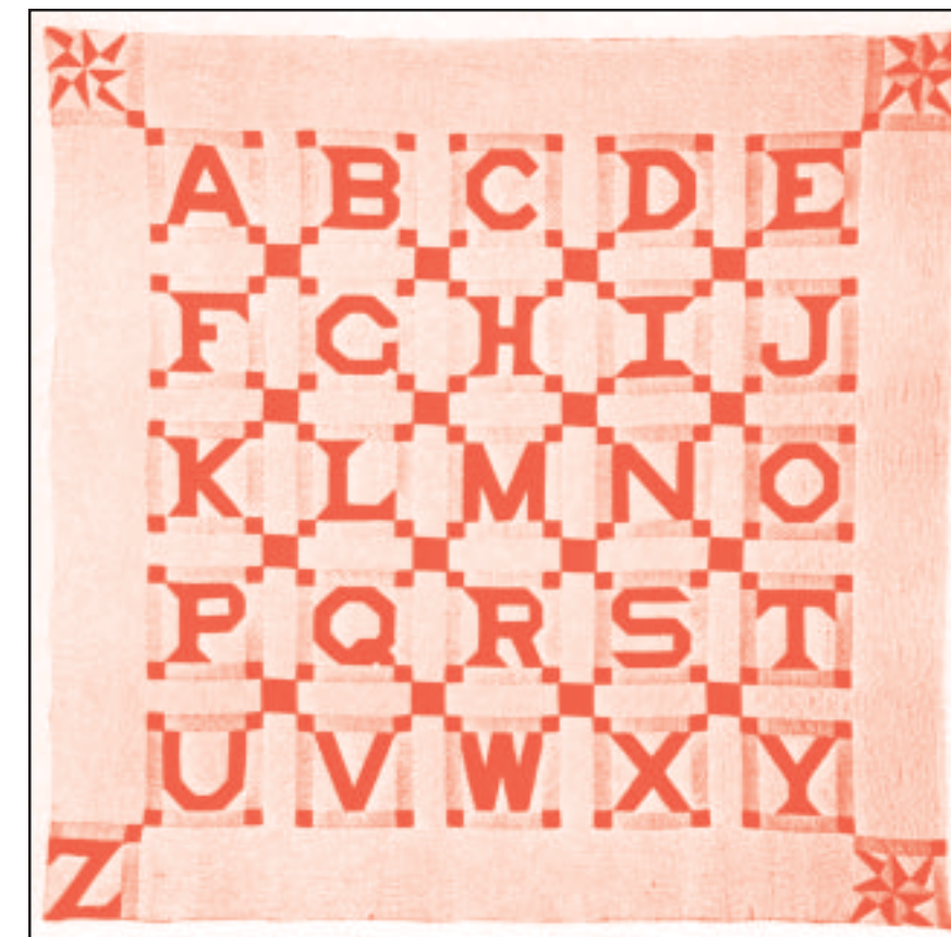
© Alphabet quilt, c. 1875, found in Berks County, Pennsylvania.

A Model Designed for Integrated Learning and Teacher Training . . .